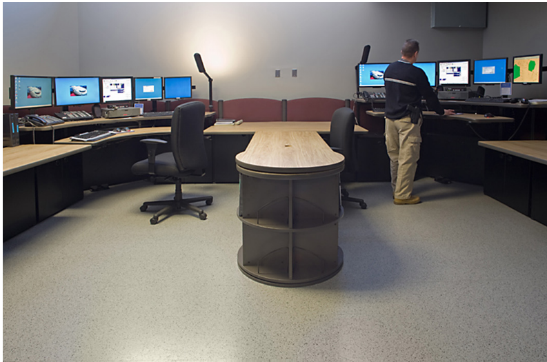
Lowell Police Department, Lowell, MA floor: floating (glue-free) static-free rubber