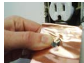
Step 3. Punch small hole in 24" copper grounding strip provided with ESD flooring. The hole should be smaller than the head of the screw removed in Step 2.