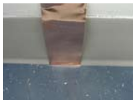
Step 6. Cover copper strip on floor with conductive adhesive and new StaticWorx ESD Flooring. For a cleaner installation, copper can be covered by wall base.