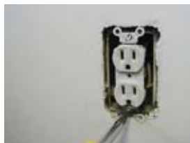
Step 2. Locate and remove grounding screw inside AC electrical outlet.