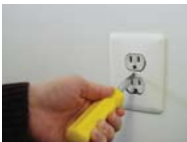
Step 1. Remove center screw on cover of AC electrical outlet using a screw driver.

Prior to the installation of the static control flooring the electrical contractor can tie in a ground wire (#10 or #12) to a convenient ground bus or an electrical outlet. Then the wire is fed down the inside of the wall to the floor line, where the baseboard meets the floor. Bring the wire through a small hole in the drywall at the floor line. From here it can be easily attached to the floor ground. The exposed end of the copper-grounding strip is then wound together with the ground wire and tightened together with the use of a wire nut to securely hold it in place. This connection of the two leads is then pushed into the hole in the wall along with the excess wire. The baseboard or wall base can be used to cover the strip when once they are applied to the wall.