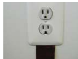
Step 7. Finish installation by re-attaching AC outlet cover with screw removed in Step 1.