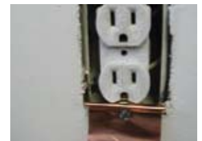
Step 4. Secure copper strip to the AC electrical outlet with the same screw removed in step 2.