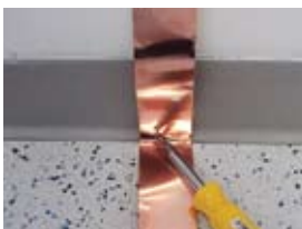
Step 5. Allow 24" copper strip to run down wall to sub floor. Fold copper at 90 degree angle at point where the wall meets the floor. Lay remainder of copper strip flat on subfloor. At least 2 inches of copper should contact the floor.