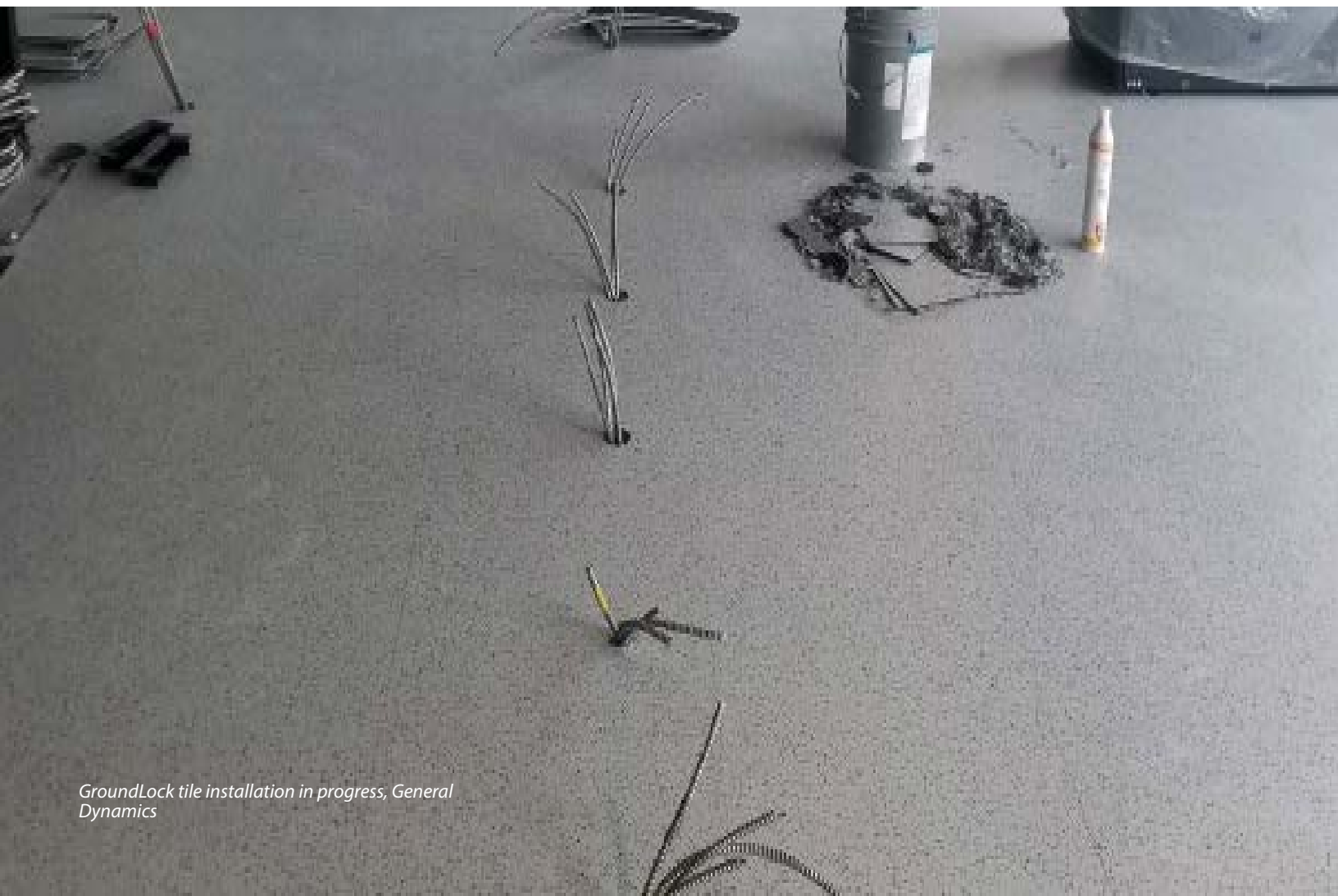
GroundLock tile installation in progress, General Dynamics