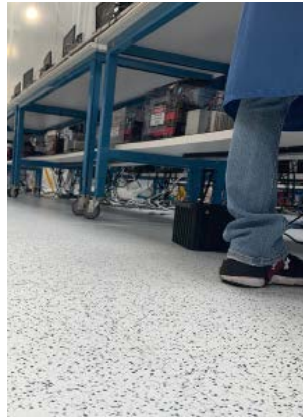
GroundLock Extreme installed at Advanced Motion Controls Notice tight, invisible seams.