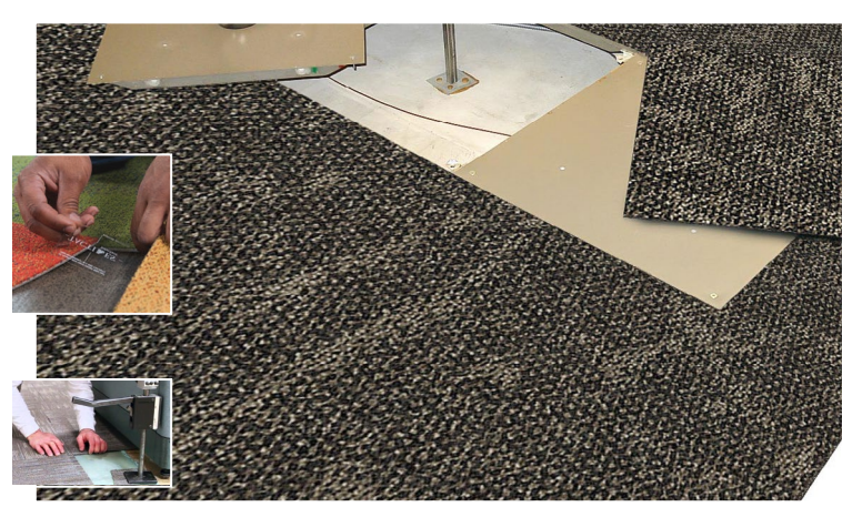
Floating ShadowFX carpet tile installed over access flooring

ANSI/ESD S20.20-2014: For electronics handling