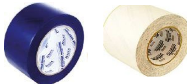
Kovara MBX Seam Tape and Kovara Double-Sided Tape

Kovara 95 protects against alkalinity and moisture in concrete slabs up to 94.9% RH and can be identified by its gray surface. Kovara 95 seam tape (2" wide and 180' long, gray) is used to tape the seams of Kovara 95. Kovara double-sided tape (4" wide and 100' long, white) is utilized in heavy rolling load installations using a box grid method.