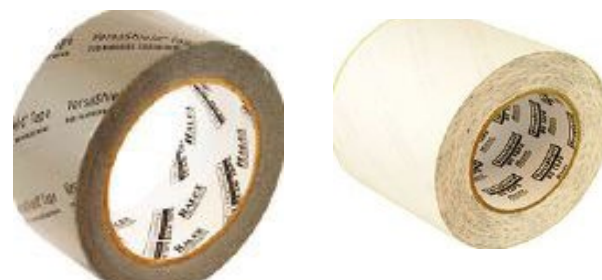
Kovara 95 Seam Tape and Kovara Double-Sided Tape (heavy rolling loads)