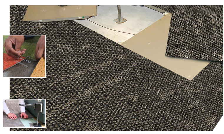
Floating ShadowFX carpet tile installed over access flooring