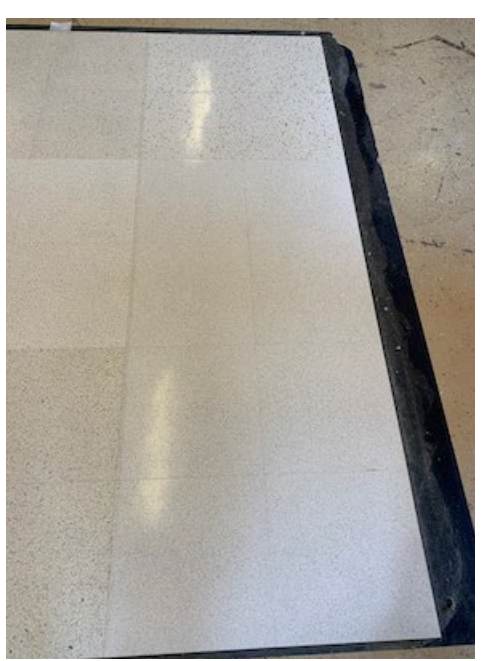
We tested RESTORE on SVT floors from several manufacturers in various colors.