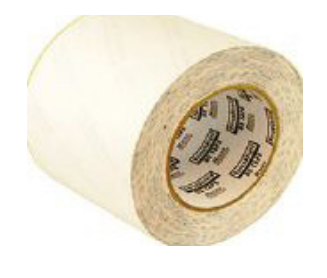
Kovara MBX Seam Tape and Kovara Double-Sided Tape