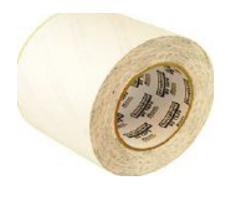
Kovara 95 Seam Tape and Kovara Double-Sided Tape (heavy rolling loads)