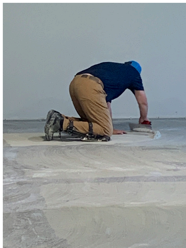
Figure 2: Adhesive installation

Sealers: The use of sealers on floor surfaces is generally not necessary except for sanded, dusty, porous, and acoustical surfaces. Sealing cannot overcome moisture conditions and must not be used for that purpose. When used, sealers must be thin and fast drying. They should be compatible with adhesives, which should be applied only after sealer is dry.