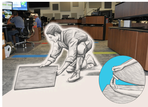
Figure 1: Installing ShadowFX with TacTiles in a 24/7 mission-critical environment.