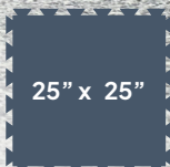
25" x 25"

High density conductive pathways designed for Class-0 and other ultra-sensitive applications.