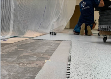
4000 ft 2 of tile installed in 1 day.

Installable over any sub-floor, with no disruption and no permanent commitment—an ideal solution for leased spaces, concrete slabs with vapor issues, occupied spaces, and spaces requiring fast installation.