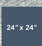
24" x 24"